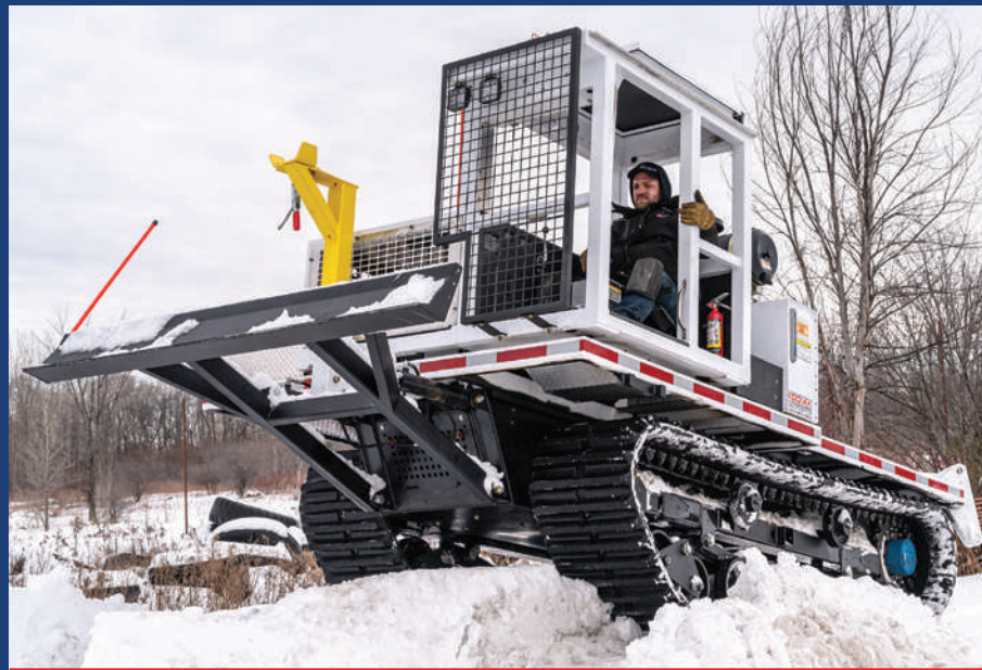
Low ground pressure gives excellent flotation on soft ground and 36" fording capability