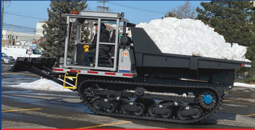
Dump Box capacity 5 cubic yards