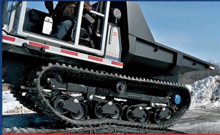
Patented walking beam with double twin rocker arm bogie wheel suspension keeps the track in full contact with the ground and absorbs impacts