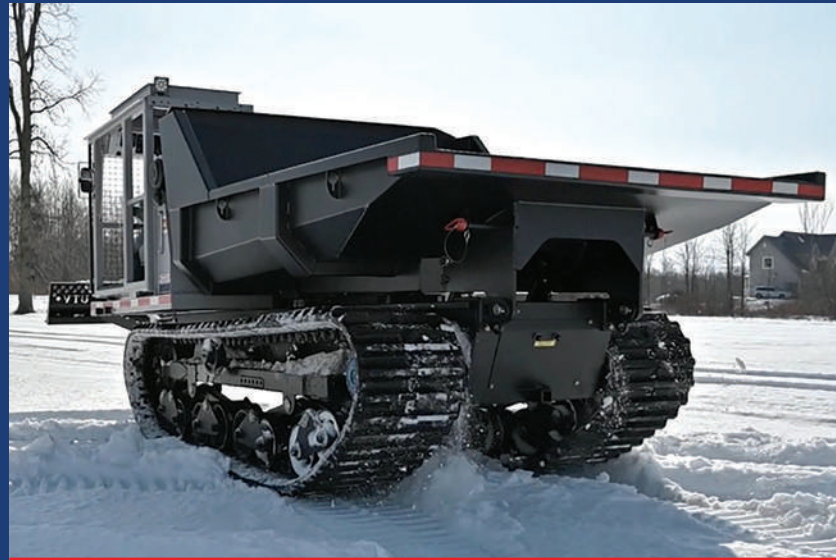
Max speed 8 MPH, Payload 12,000 lbs