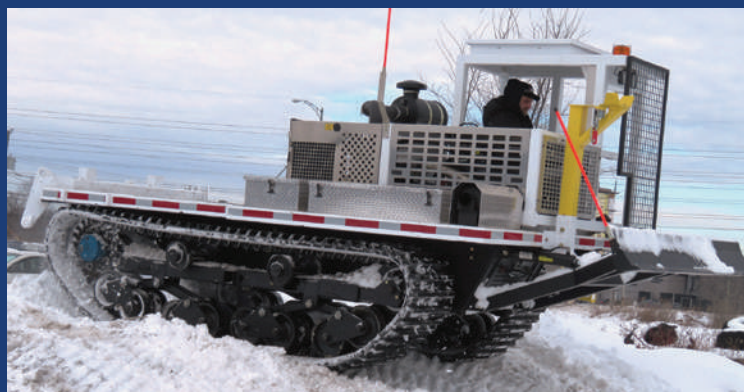
Kodiak K6 is powered by a 134 HP engine

KODIAK CRAWLER CARRIERS CAN ALSO MOUNT CRANES, WATER OR FUEL TANKS, SPRAY TANKS OR SPREADERS