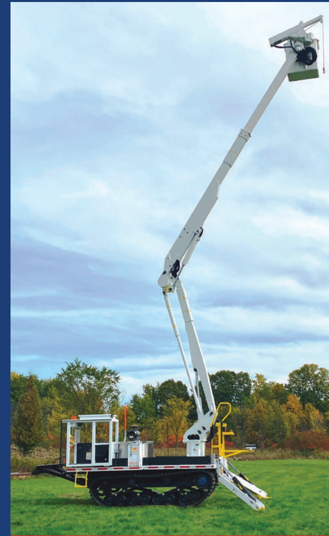
55 ft reach, 2-man bucket