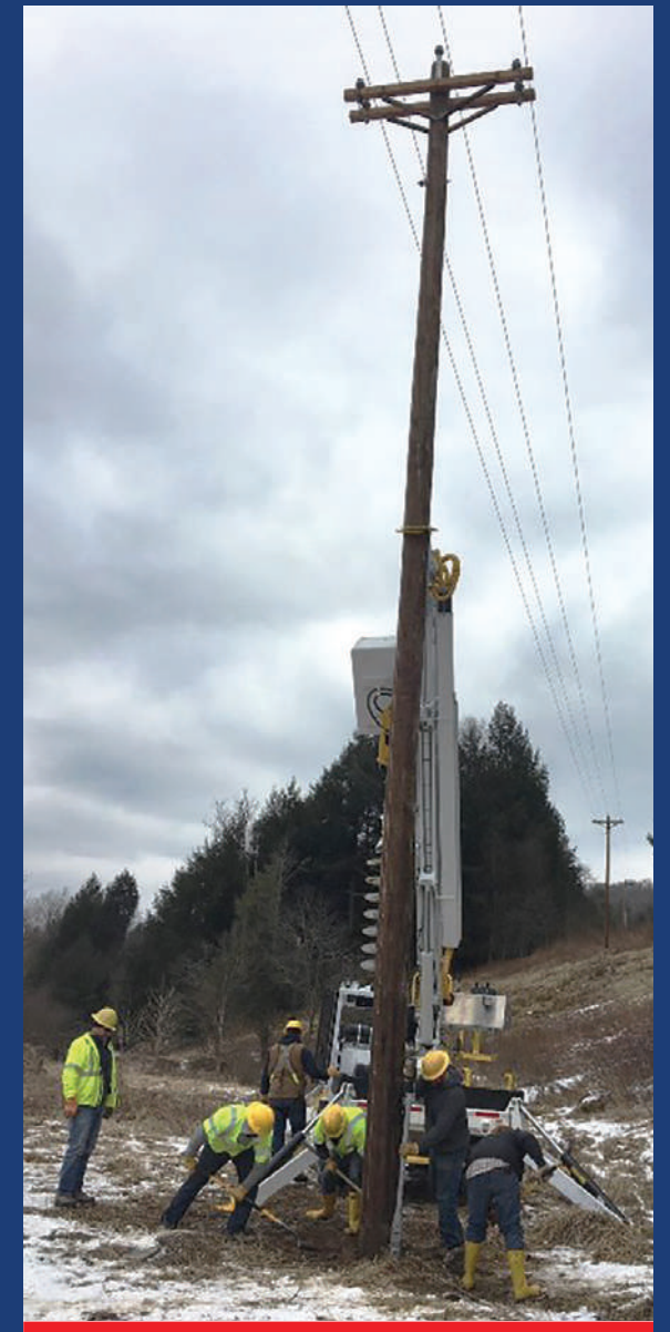
Digger Derrick Mounting