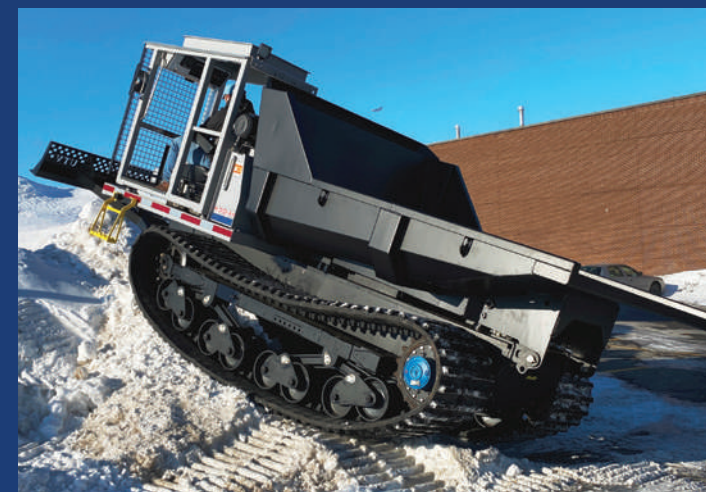
Kodiak climbs a 35 degree slope with ease and with excellent sideslope stability

KODIAK CRAWLER CARRIERS CAN ALSO MOUNT CRANES, WATER OR FUEL TANKS, SPRAY TANKS OR SPREADERS